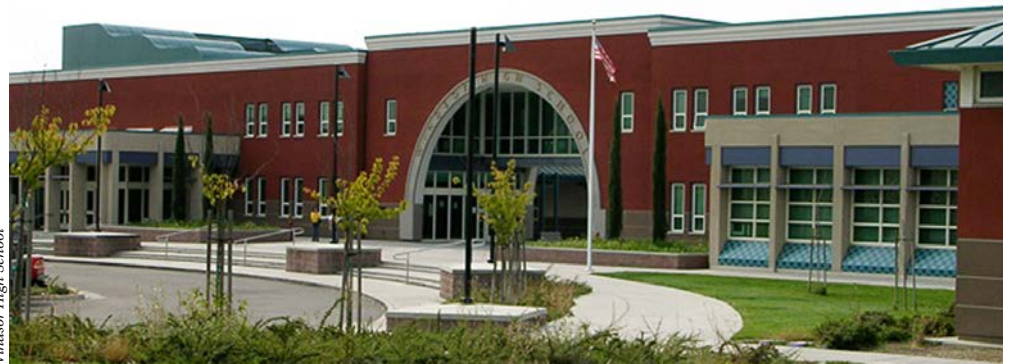
Windsor High School

Windsor serves its secondary students in one middle, one high, and one alternative high school—and each of these schools has earned state recognition for academic excellence. The high school campus, which opened in 2000, has a performing arts center, culinary arts institute, state-of-the-art digital media facility, agricultural center, and extensive advanced placement courses.